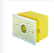
Adaptor for installation like box 503 Luc297