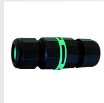
IP 68 fast connector Luc22080