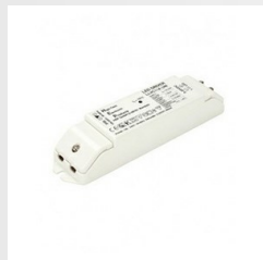
LED DRIVER 350 mA IP20 AC620