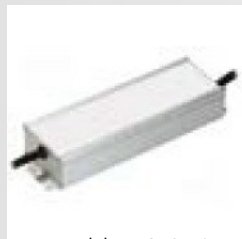
Led driver 350 mA IP67 AC620-IP67