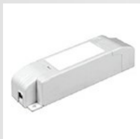
Remote control 1050 mA 57 & %$