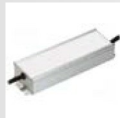
Led driver 350 mA IP67 AC620-IP67