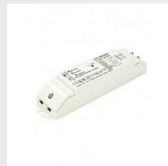
LED DRIVER 350 mA IP20 AC620