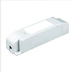
@8 Xf] Yf @V&$$%