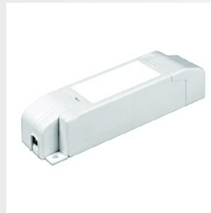
@8 Xf] Yf @V&&$%$