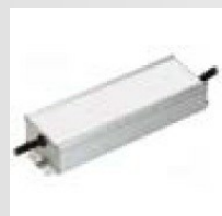
Led driver 14W 700mA AC624-IP67