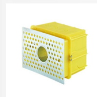
Adaptor for installation like box 503 AC296