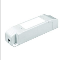
LED driver Luc22014