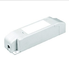
LED driver Luc22008