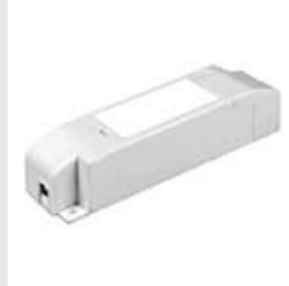
LED driver 350 mA IP20 AC620