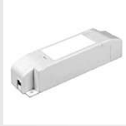
LED driver 350 mA IP20 AC620