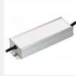
LED driver 350 mA IP67 AC620-IP67