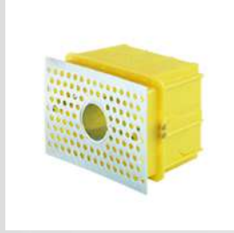
Wall recessed rough-in housing 503 with adapter AC295