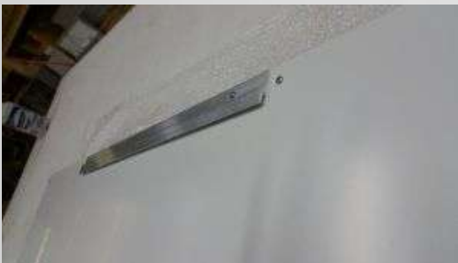
SECOND PART INSTALLED ON THE LIGHT BOX