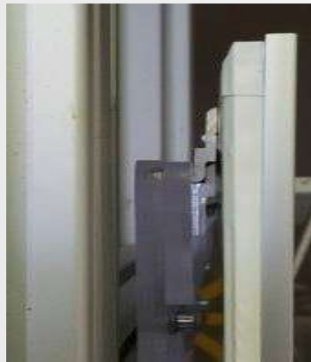
LIGHT BOX HANGING ON "Z" CLIP