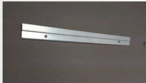
ONE PART INSTALLED ON THE WALL